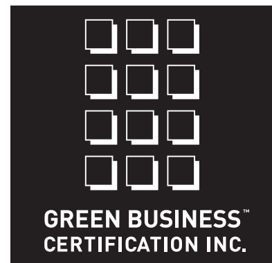
Logo with abbreviation