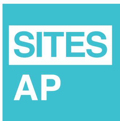
PMS 3115 C

The standard color for the SITES® AP mark is PMS 3115 C. The black and white versions of the logos can be used when necessary.