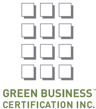
Logo with signature

The standard color for the GBCI logos is PMS 370U and PMS 11U or 60% black. The black and white versions of the logos can be used when necessary.