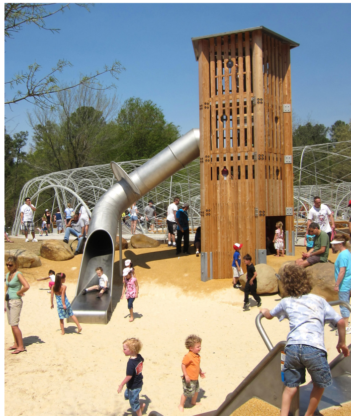
SITES Certified Woodland Discovery Playground | Memphis, TN

By supporting the SITES certification system, SITES APs help ensure landscapes and places implement nature-based solutions to climate change, conserve resources, create regenerative systems, foster resiliency, and enhance human well-being. SITES APs are critical to educating clients, colleagues and the community about the essential role that SITES plays in protecting and restoring the environment and the community.