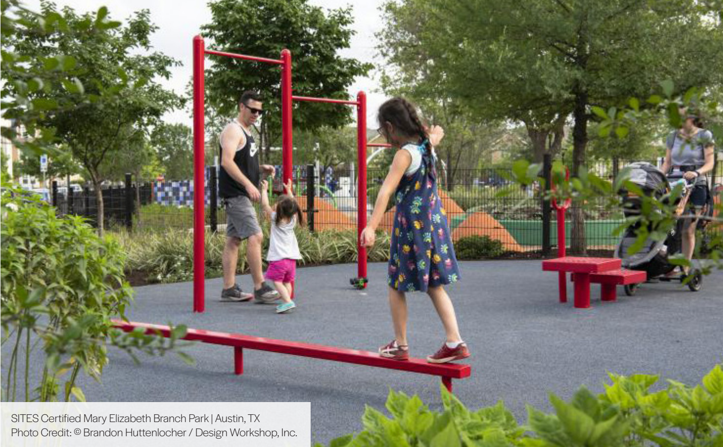
SITES Certified Mary Elizabeth Branch Park | Austin, TX